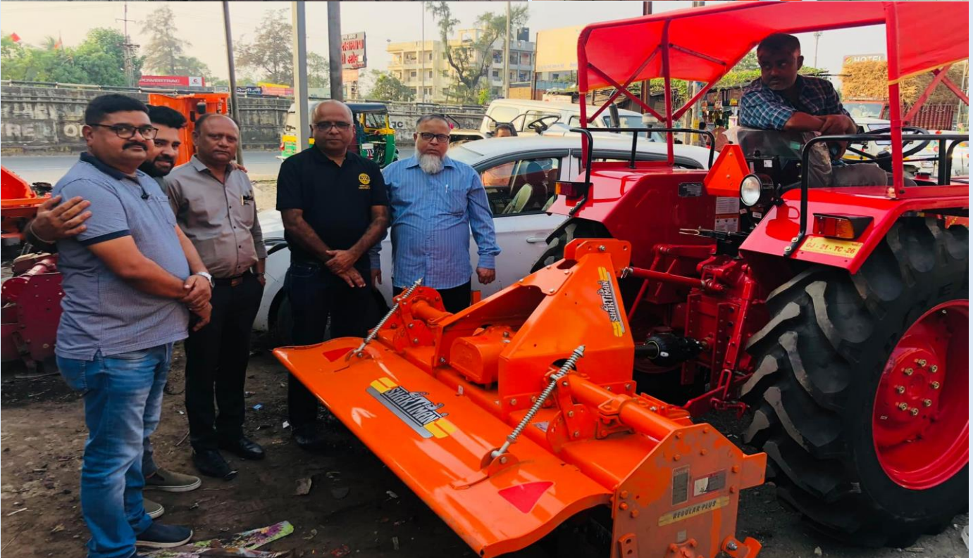
FREE TRACTOR SERVICE WITH ROTOR AND CULTIVATOR FOR SMALL FARMERS – A RCRF SERVICE PROJECT